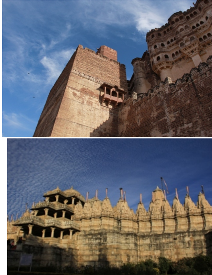
Mehrangarh fort, Jodhpur/ Jain Temple, Ranakpura

The state is diagonally divided as the hilly and rugged south-east region and dry and barren north-east Thar Desert. Here, folk culture still retains all its colour and vivacity with exuberant celebrations of fairs and festivals. A music that echoes across the desert emptiness. Some of the popular fairs are Pushkar Camel and Cattle fair held annually in November, Camel Festival Bikaner held annually in January, Desert Festival Jaisalmer held annually between end January to mid February etc. The exact dates of the fairs is determined by the Indian Lunar Calendar.