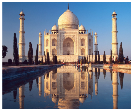
Hawa Mahal/Taj Mahal