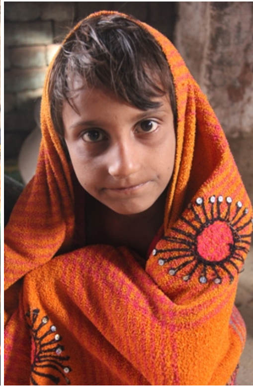
Elephant ride at Amber Fort/ Rajasthani Boy

Day 10 Pushkar-Jaipur (140km, 4hr+): In the morning visit the Brahma temple and the holy lake. On completion drive to Jaipur. Jaipur is the capital city of Rajasthan. Also known as Pink City. One of the oldest planned city. ON Jaipur